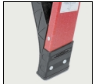
Molded external rail shield to protect against abrasion damage