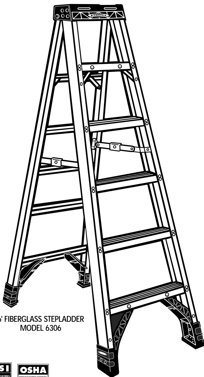
6' FIBERGLASS STEPLADDER MODEL 6306