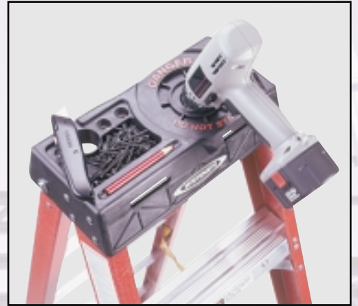
Tool-Tra-Top® with drill holster